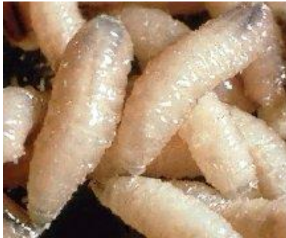
Screw Worm Larvae

Please help the Florida Department of Agriculture and the USDA eradicate this horrible disease as quickly as possible. This is necessary to protect our pets, Key Deer and livestock.